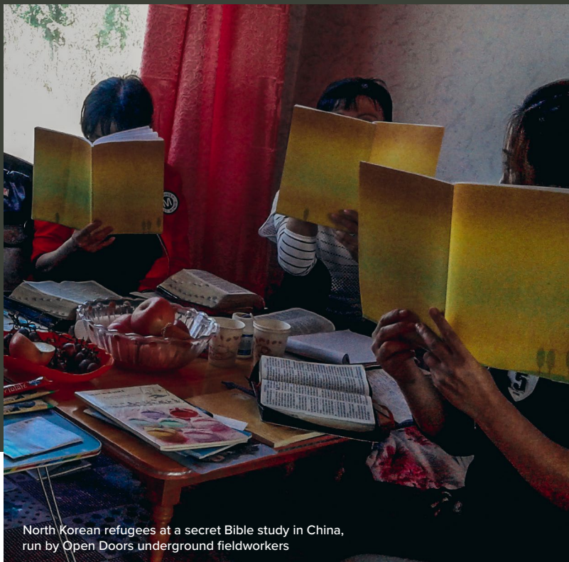
North Korean refugees at a secret Bible study in China, run by Open Doors underground fieldworkers